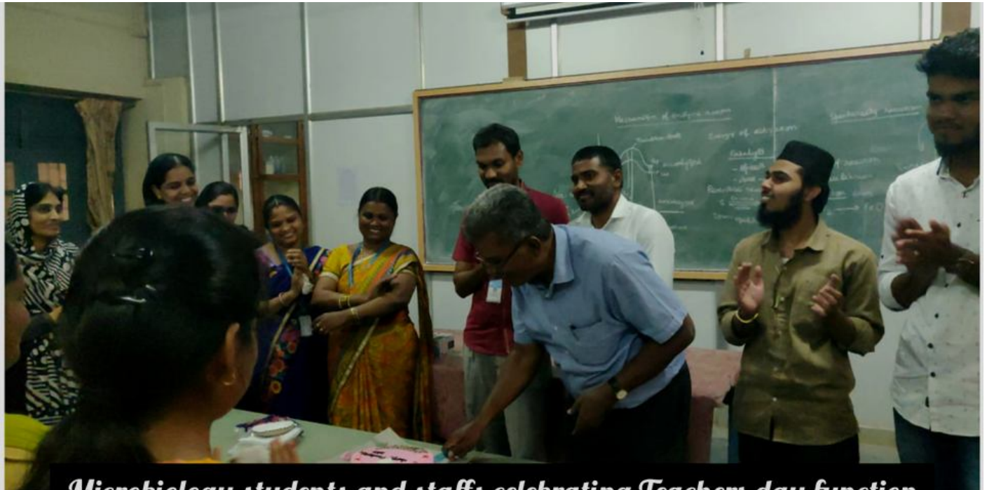
Microbiology students and staffs celebrating Teachers day function